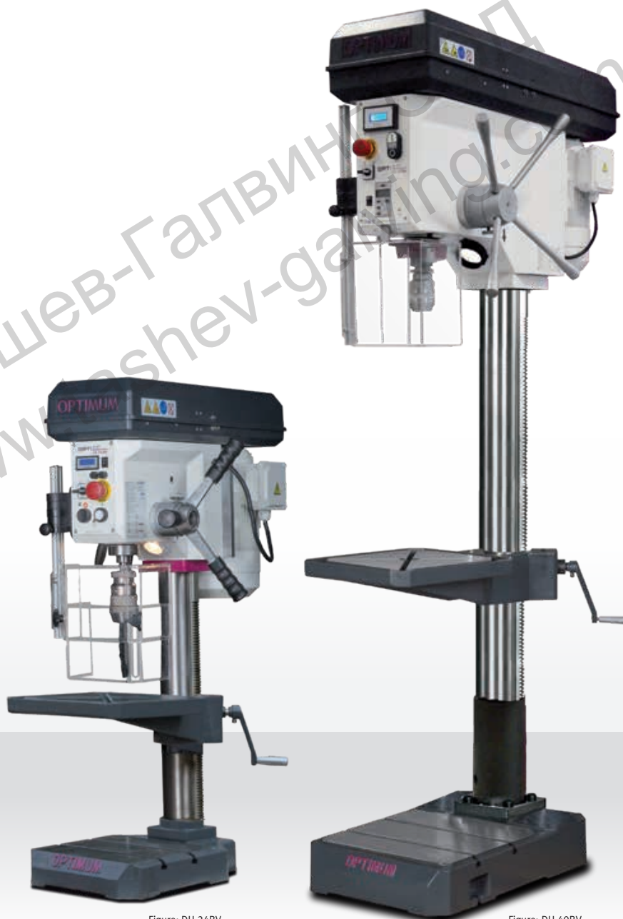
Figure: DH 24BV